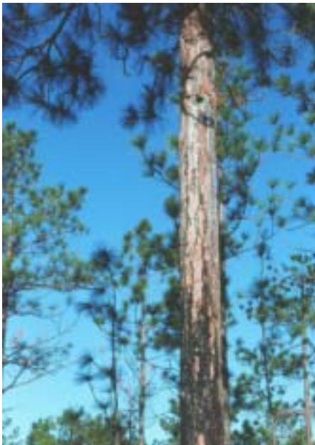
Top: Male RCW bringing food to nest cavity (note difficulty seeing red-cockade); bottom: RCW active cavity tree (note candle-like appearance and evidence of recent prescribed fire)

The RCW is the only North American woodpecker to excavate roost and nest cavities in living pine trees. While longleaf pine is the preferred species for excavation, other species such as loblolly, shortleaf, slash and pond pine are also used depending on the local forest type and tree species availability. The use of live pines as roosting and nesting sites may have evolved in response to living in a fire maintained ecosystem where frequent fires, primarily in the growing season, eliminated most standing dead pines (snags). Longleaf pine is thought to be preferred by the woodpeckers because it is the