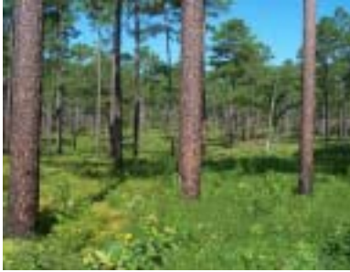
A tract of virgin longleaf pine forest on private land in south Georgia; oldest trees are 400-500 years old. Only about 3000 acres of the southeast's original 90,000,000 acres of virgin longleaf pine forest remains; Grant Hilderbrand, USFS

is Safe Harbor. Originally developed for RCW conservation, the Safe Harbor approach is now being applied to many other listed species that occur on private lands. Under a Safe Harbor agreement, a landowner voluntarily agrees to protect and manage habitat for the 'baseline'