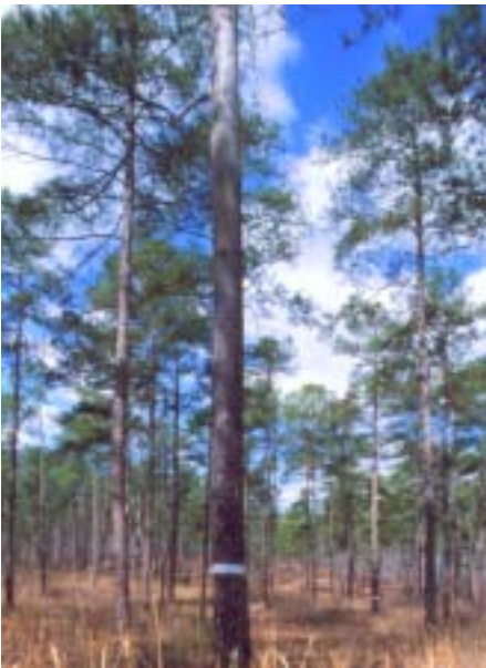
Top: completed, very active cavity (note the large resin wells, thick resin flow and plate formation, indicating a cavity that has been in use for years); Bob Hooper, USFS; middle: RCW cluster in longleaf pine forest; Bob Hooper, USFS; bottom: RCW cluster in shortleaf pine/loblolly pine forest; Phillip Jordon