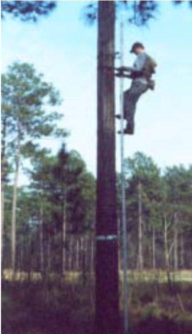
Wildlife biologist climbing RCW nest cavity tree, with ten foot sectional Swedish climbing ladders, to capture and band nestlings; Nancy Jordan, Clemson University

property managers and biologists band their RCWs (both adults and nestlings), survey and map cavity trees and annually monitor nesting activities to assess population health. Research findings on the bird's natural history and ecology have enabled landowners and managers to implement habitat improvement programs. The positive population trends (early 1990's to present) on many public and private lands are a direct result of successful implementation of a well-coordinated regional translocation program and habitat improvements, such as controlling midstory, prescribed burning, and installing artificial cavities.