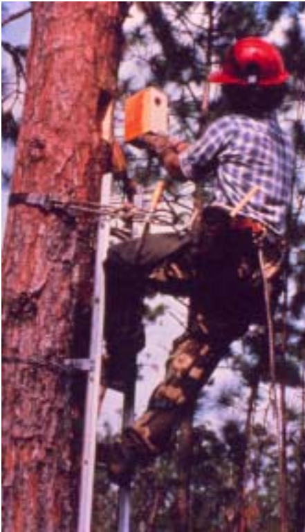
Top: subadult female and male in preparation for translocation to a recruitment cluster; Mike Lennartz, USFS; bottom: wildlife biologist installing artificial cavity insert; USFS

saving critically small populations in danger of 'extirpation' or disappearing; developing a better spatial arrangement of groups to reduce isolation; introducing birds to suitable habitat; and increasing genetic diversity in critically small populations. Typically, two types of translocations are conducted: a female juvenile is moved to a solitary male group; and an unrelated male and female juvenile are moved to a 'recruitment' cluster in hopes of establishing a new group. Recruitment clusters are established by installing artificial cavities in unoccupied but suitable