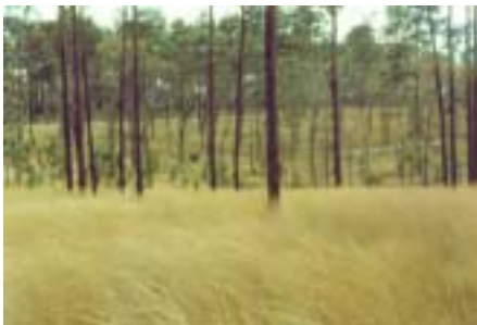
Top: longleaf pine forest with turkey oak midstory; middle: high quality, longleaf pine RCW foraging habitat; bottom: longleaf pine forest with young trees and wiregrass understory

Habitat Management Degradation and loss of habitat led to the rapid decline of RCWs. Conservation and management of adequate habitat is central to recovery goals. Quality habitat includes forests with trees old enough for roosting, generally at least 80-120 years old, depending on species of pine. Hardwood midstory results in cluster abandonment; therefore, it is critical that hardwood