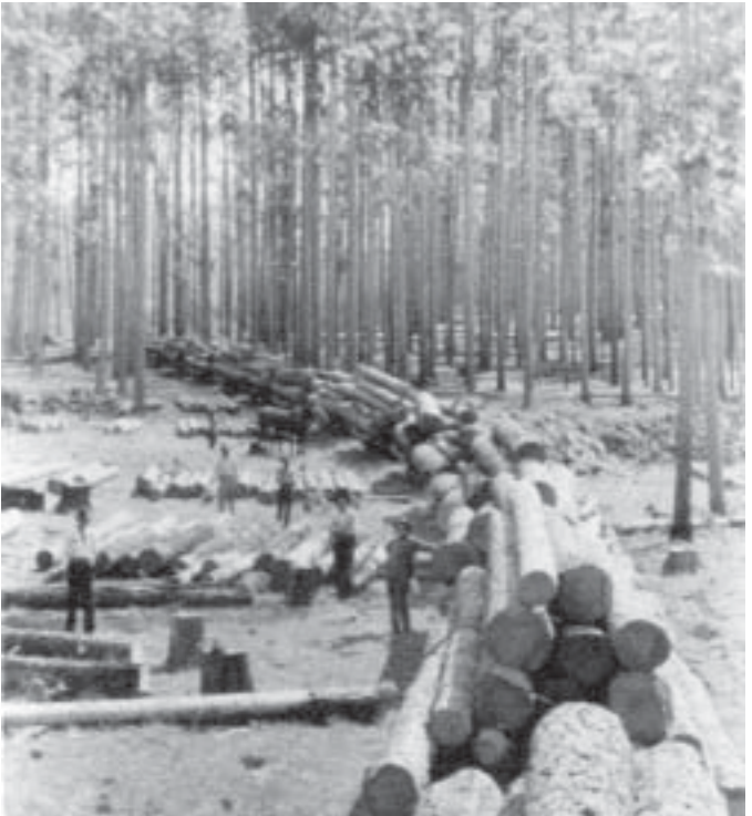
Top: Turn of the century (1900) logging of virgin longleaf pine forest in east Texas; courtesy of the East Texas Research Center, Steen Library, Forest History Collections, Stephen F. Austin State Univ, Nacogdoches, TX. Bottom: Turn of the century (1900) logging of longleaf pine forest in east Texas; courtesy of the East Texas Research Center, Steen Library, Forest History Collections, Thompson Family Lumber Enterprises Collection, P90T:202, Stephen F. Austin State Univ., Nacogdoches, TX