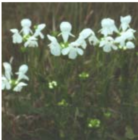
Top: white birds-in-a-nest (Macbridea alba), federally listed as threatened, endemic to longleaf pine forests in Florida; one of many listed, rare, endemic, herbaceous plants unique to southeastern pine ecosystems; Joan Walker, USFS; bottom: longleaf pine - wiregrass habitat; a result of frequent growing season prescribed fires; Joan Walker, USFS