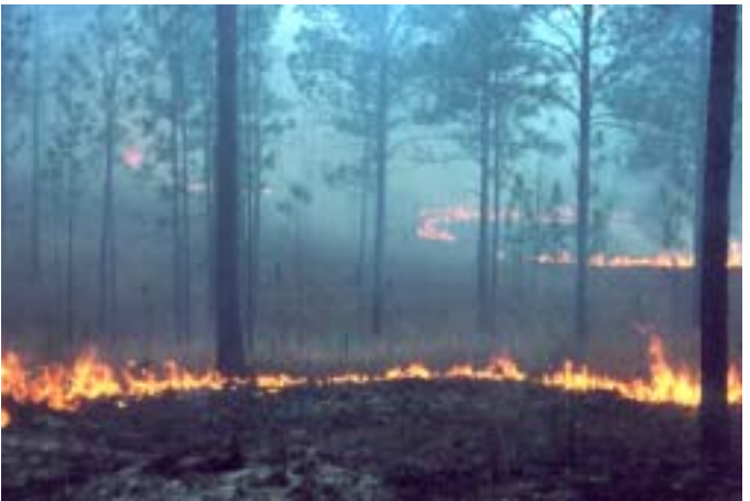
Top: lightning-ignited wildfire in longleaf pine forest; Ralph Costa, USFWS; bottom: slow moving ground fire in longleaf pine forest likely typical of 'historic' natural and human ignited fires; D. Craig Rudolph, USFS

strikes, which occur more frequently in the southeast than anywhere else in North America. Most fires started by lightning strikes occur in the spring and summer growing season, when thunderstorms are more prevalent. Native Americans and later European settlers used fire to clear land and improve hunting grounds. However much of this burning was accomplished during the winter, the non-growing season. Frequent fires created an open forest, with large pines, little to no mid-story, and a diverse herbaceous groundcover; described by many 19th century naturalists as 'park-like' because they could easily ride horses and wagons across the land. Many of the groundcover plant species show