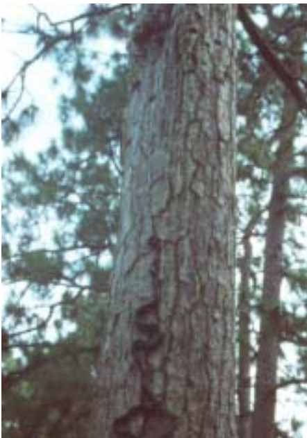
Top: female RCW working on resin well; bottom: black rat snake climbing RCW cavity tree

outbreaks such as the southern pine beetle. RCWs use this increased resin flow for cavity defense by chipping holes, called 'resin wells', above and around the entrance to the cavity as a defense against predators. Rat snakes, skillful at climbing trees, are the main predators of RCW nests. Resin flow produced by the wells creates a physical and chemical barrier that impedes the snake's movement up the tree. The birds also scale the outer bark off the tree above and below the cavity entrance, exposing sapwood around the cavity entrance forming a 'plate' around the cavity. Resin flowing from the