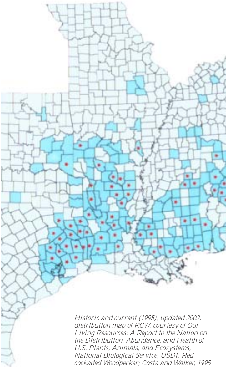
Historic and current (1995); updated 2002, distribution map of RCW; courtesy of Our Living Resources: A Report to the Nation on the Distribution, Abundance, and Health of U.S. Plants, Animals, and Ecosystems, National Biological Service, USDI. Red-cockaded Woodpecker; Costa and Walker, 1995

Current Red-cockaded Woodpecker Distribution (Federal, State, and Private Sector Biologists 1993, 1994; updated 2002)